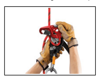
The descender has a safety gate on the moving side plate that allows the rope to be installed easily while the device remains connected to the harness.

The I'D L self-braking descender is primarily designed for technical rescue. It has an ergonomic handle that allows comfortable descent control. The integrated anti-panic function and anti-error catch limit the risk of an accident due to user error. The AUTO-LOCK system allows users to position themselves without having to manipulate the handle or tie off the device. Once locked, the rope can be taken up without having to manipulate the handle. The safety gate allows the rope to be installed with the device remaining connected to the harness. I'D L is compatible with 12.5 to 13 mm ropes and allows handling of loads up to 280 kg.